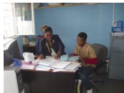
a student working in the ware house.

in the program 6 students have been provided a summer job in SABA and Gondwana. The four students working in SABA have been assigned in different services on clerical positions. The editor of this newsletter tried to assess the students situation in each service, the appreciation