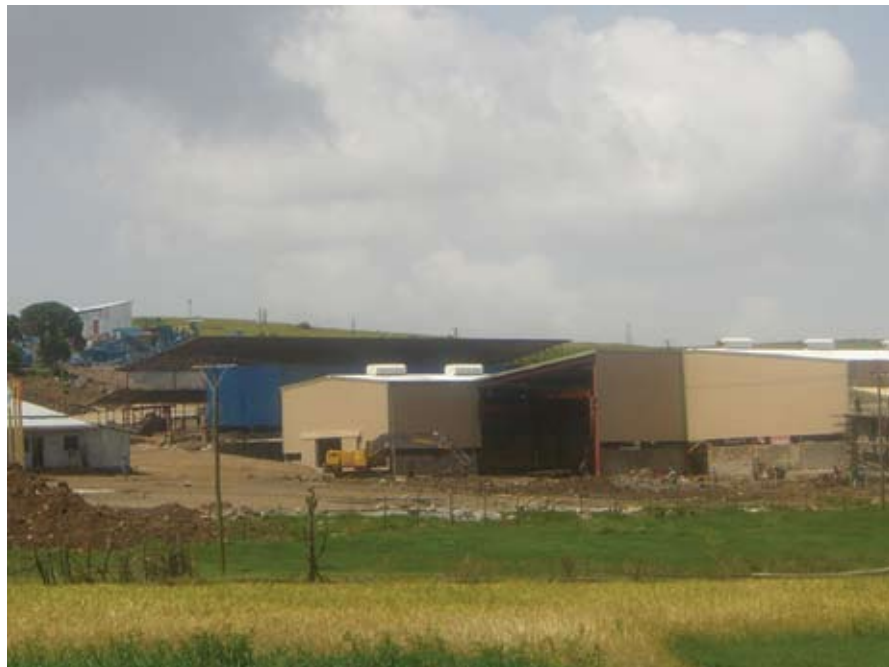
Partial View of the Plant

SABA Engineering PLC has entered into two contractual agreements signed on February 22, 2007 and November 19, 2007 with EEPCo for a supply of more than 77,000 pre-stressed concrete poles of different sizes. The project is to design, manufacturing, test and supply of pre-stressed concrete poles to region store at Debretabor town for the construction of medium and low voltage distribution networks, UEAP 8/98. The latter project is to supply pre-stressed poles to nine towns in Amhara and Tigray Regional States. It is one of a series of massive projects to be implemented by the Ethiopian Electric Power