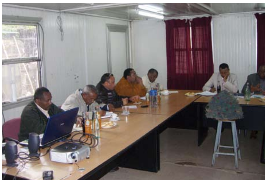
Briefing session at SABA meeting hall