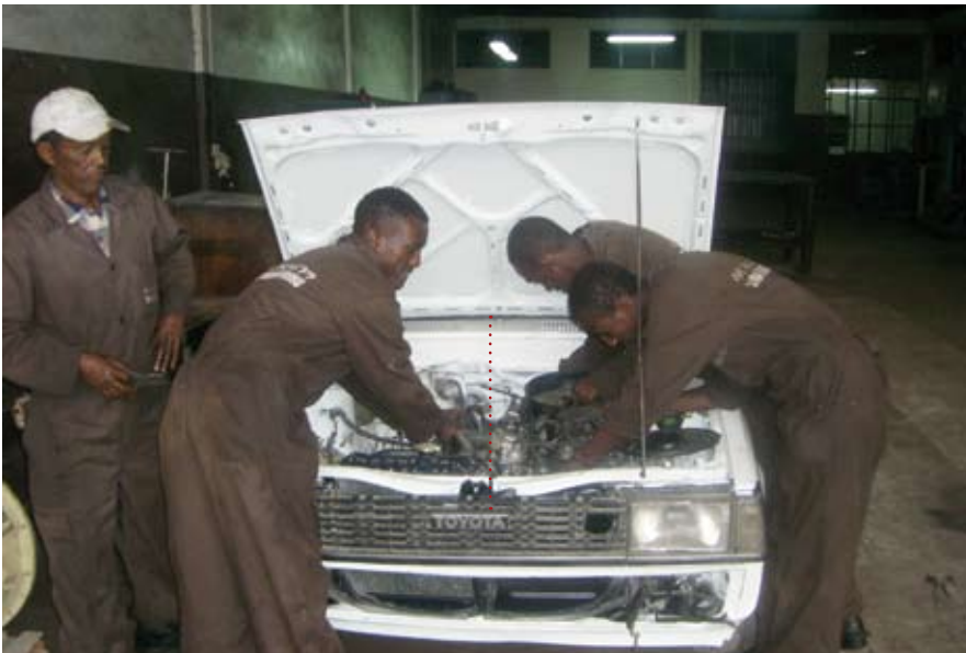
Prospective Graduates of Entoto TVET College Undertaking Apprenticeship Program

As apprenticeship students their performance will be evaluated as partial fulfillment requirement for their graduation, to be applied to both the surveying and auto mechanic prospective graduates. This is a program financed by GTZ and implemented by the Ethiopian Government Ministry of Education.