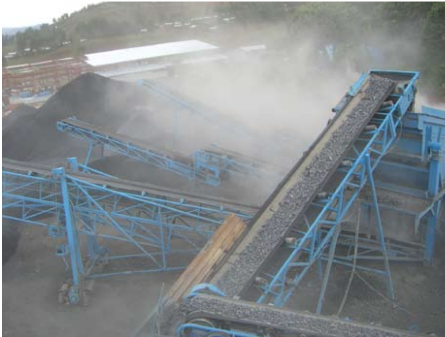
The Stone Crushing Plant Producing Different Sized Aggregates

Debretabor with its humble infrastructure and shattered situation has been selected by the client. However, the specific project site with in Debretabor has been selected by SABA based on the study of professionals on the availability of the necessary construction material and suitability of the site. The required land has been requested and a total area of 38,235.34 square meters has been acquired for concrete plant erection, crusher quarry as well as for office and camping in cooperation and support of the local officials.