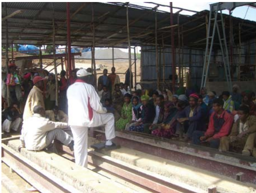
Local Employees Taking HIV AIDS Awareness Session at the Site

Department of SABA drilled a bore hole and installed a pump and supply pipe lines. The department also constructed two water tankers with a capacity of 100,000 lit to effect sustainable water supply.