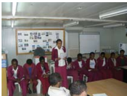
The student delivering speech on the meeting

Derartu Tulu Preparatory Secondary School is a neighboring public school with humble facilities. To that effect, the school sent letter of request to help the effort in improving the modest facilities in the school. Helping needy but outstanding students was one of the proposed alternatives to alleviate the school problems.