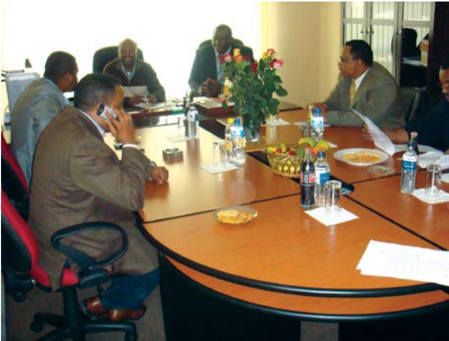
Meeting with Ram Energy High Officials

A Memorandum of Understanding (MOU) has been signed between SABA Engineering PLC and RAM