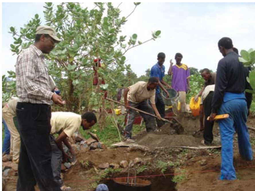
33 kv Concrete Pole Foundation Work Under Construction

SABA signed a contractual agreement with EEPCo on