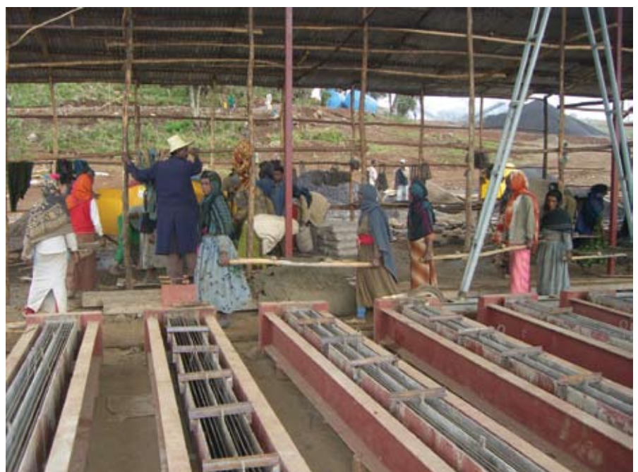
Participating the Local People at Large