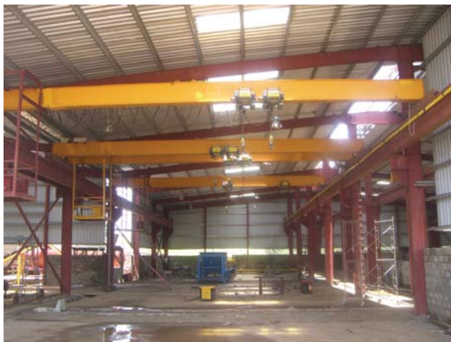
Partial View of the Plant