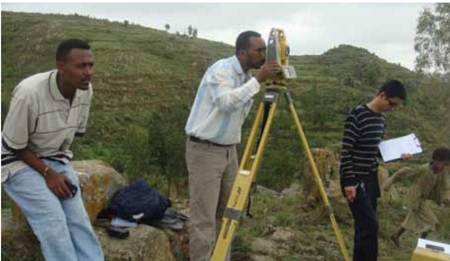
The Supervision work in progress

The Government of Ethiopia obtained funds from the Kuwait fund for Arab Economic Development toward the cost of constructing the Wukro-Adigrat-Zalambessa road upgrading project. SABA Engineering PLC in association with Gondwana Engineering