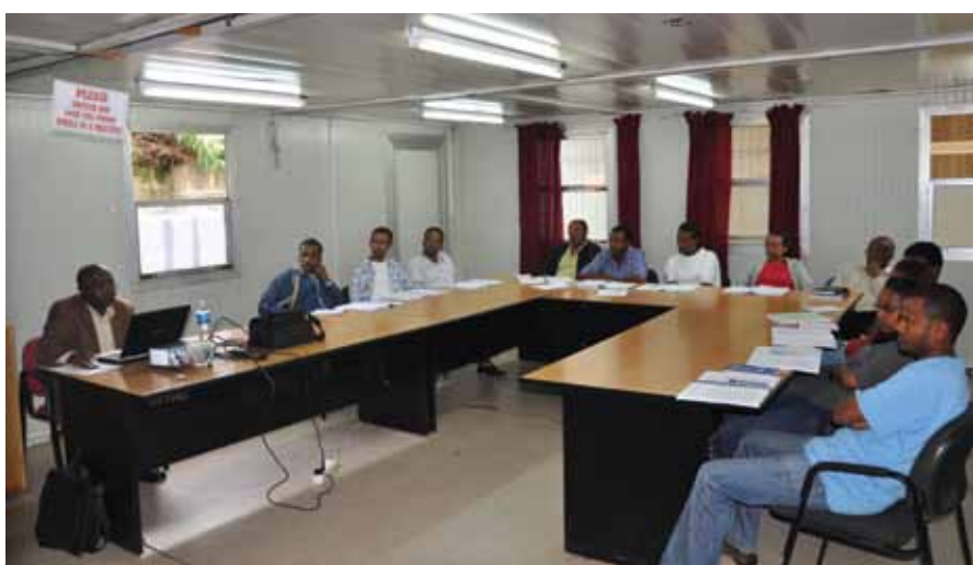
The Geotechnical Investigation training at SABA Conference Hall