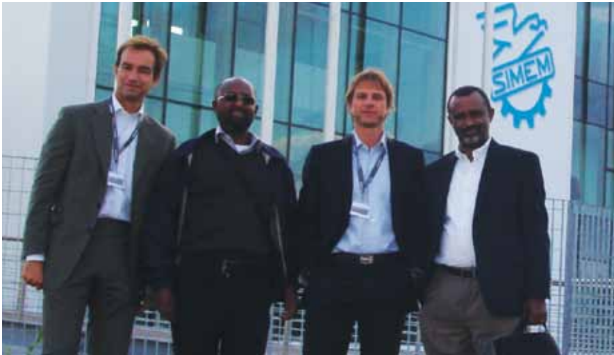
A group picture with SIMEM's officials at SIMEM head office