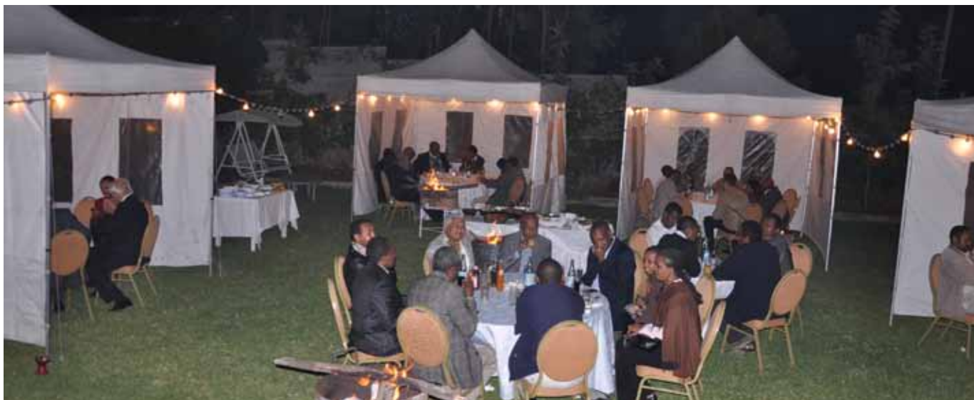
Partial view of the dinner reception