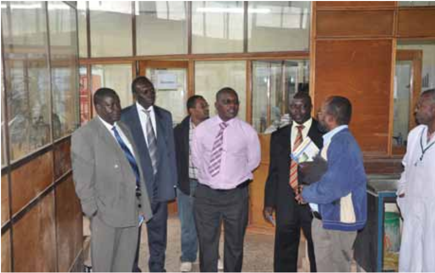
While the Ugandan delegates visitig SABA's Material Testing Laboratory