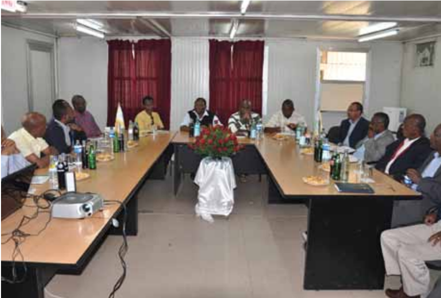
SABA management members on a meeting with the Kenyan delegates