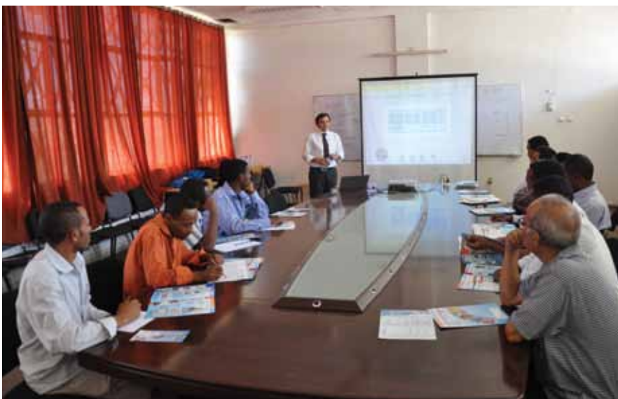
Presentation held at Diredewa University